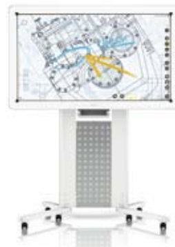
RICOH Interactive Whiteboard D5500