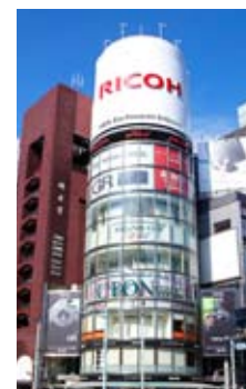
San-Ai Dream Center