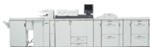
RICOH Pro C900