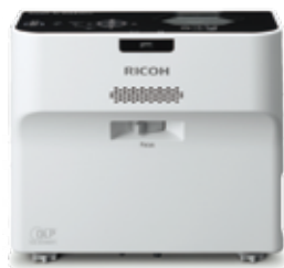
RICOH PJ WX4141NI