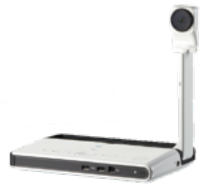
RICOH Unified Communication System P3000