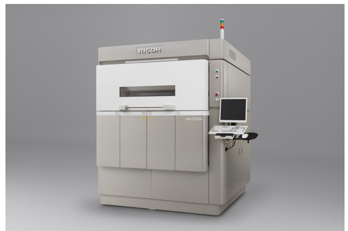
RICOH AM 5500P, Ricoh's first 3D printer