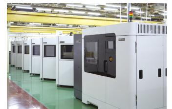
RICOH Rapid Fab (at Atsugi Plant)