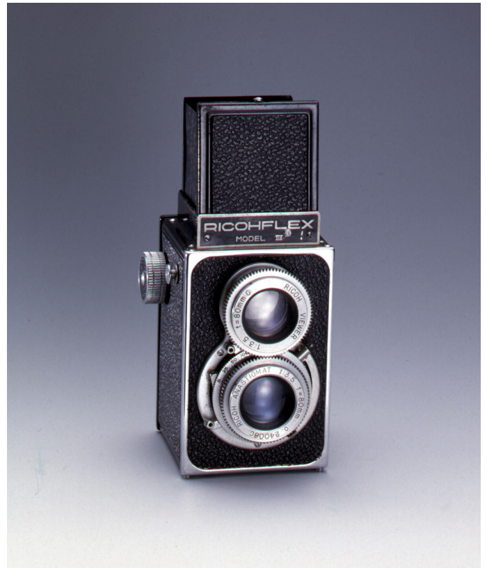
Ricohflex Model III (1950)

In 1953, Ricoh became Japan's first manufacturer to introduce a belt-conveyor production system. For its successful establishment of the mass production system, Ricoh was recognized by the Okochi Memorial Foundation with a production award